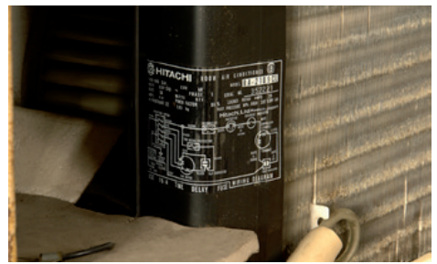
5 Check for a wiring diagram