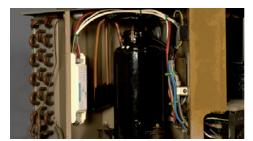
(1) Check correct wiring & replace covers