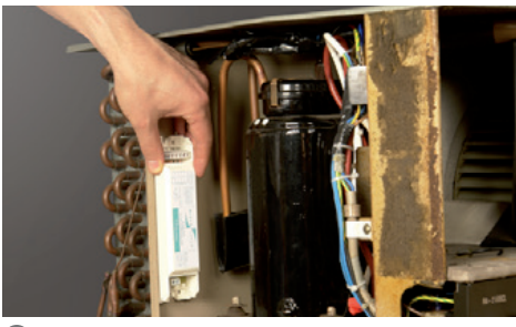
4 Find a suitable location