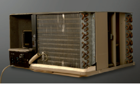
3 Disconnect power & remove covers