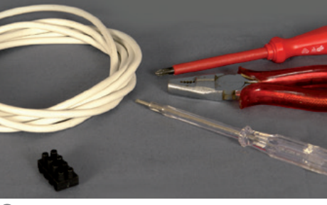
Additional required material