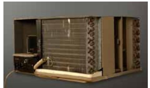
3 Disconnect power & remove covers