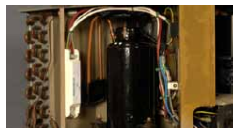
10 Check correct wiring & replace covers