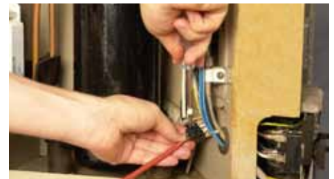
7 Route this switching wire through the AIRCO SAVER (i.e. the AIRCO SAVER is now logically in series with the thermostat). Connect power to the AIRCO SAVER.