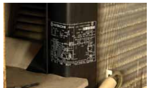
5 Check for a wiring diagram