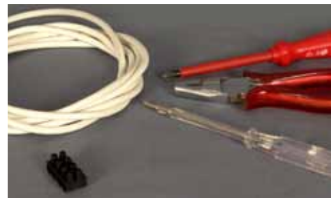
2 Additional required material