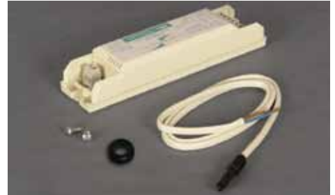
1 Provided material

For clarity's sake the images below illustrate the installation of an AIRCOSAVER into a small window unit. However, the installation steps are basically the same for other types of aircon units. Extended installation guidelines are available from the AIRCOSAVER.com website (support section).