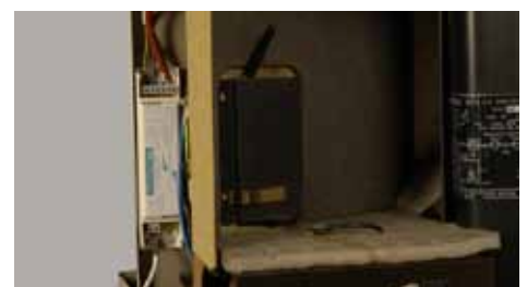
9 Position sensor in supply air stream (example)