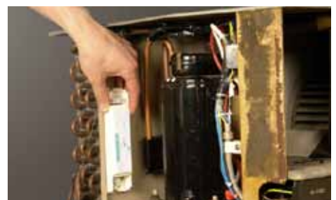
4 Find a suitable location