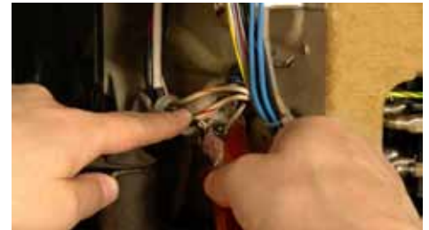
6 Interrupt compressor (or compressor contactor) switching wire. This is the cable through which the thermostat tells the compressor to run or stop.